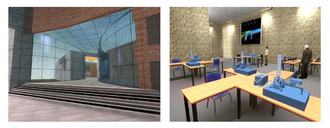
Figure 1: Virtual laboratory environment.

A virtual laboratory environment was designed, implemented and piloted at Stevens Institute of Technology (SIT) [13]. In this collaborative laboratory environment (Figure 1), the educational content is tailored to address the students' different learning modalities. A number of predefined laboratory scenarios can be scripted [12]. In these scenarios, the students can collaborate in performing the various tasks involved in the laboratory assignments. In addition, the experimental scripts embedded in the system allow the instructor to monitor whether or not all students comprising a laboratory group are actively participating and collaborating in the assigned laboratory tasks. These are widely considered two crucial factors in improving learning.