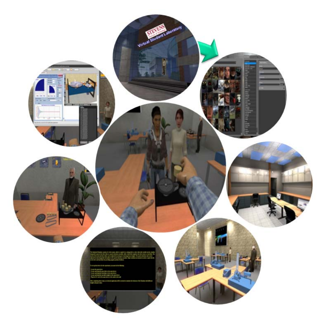
Figure 3: Scripted laboratory scenario.

Each laboratory session follows a scripted scenario (Figure 3). At the beginning of a laboratory session, the students are given a tutorial describing the experiment scenario and introducing them to the capabilities and functions of the gamebased laboratory environment. Specifically, this tutorial informs them on how to log into the experiment Web page, how to customise their game avatars (i.e. gender, outfit, physical appearances, etc.), how to divide the tasks between the group members, how to use the various built-in features of the laboratory system, how to get feedback from the instructor and, finally, how to carry out the actual experimental procedures using either a remote laboratory module and/or a simulation module.