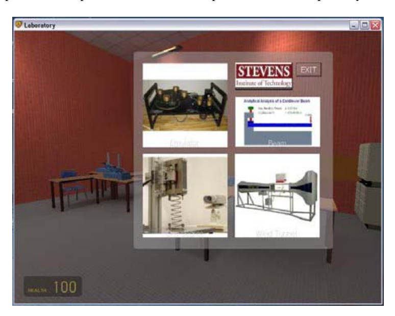
Figure 5: Integrated access to remote and virtual experiments.