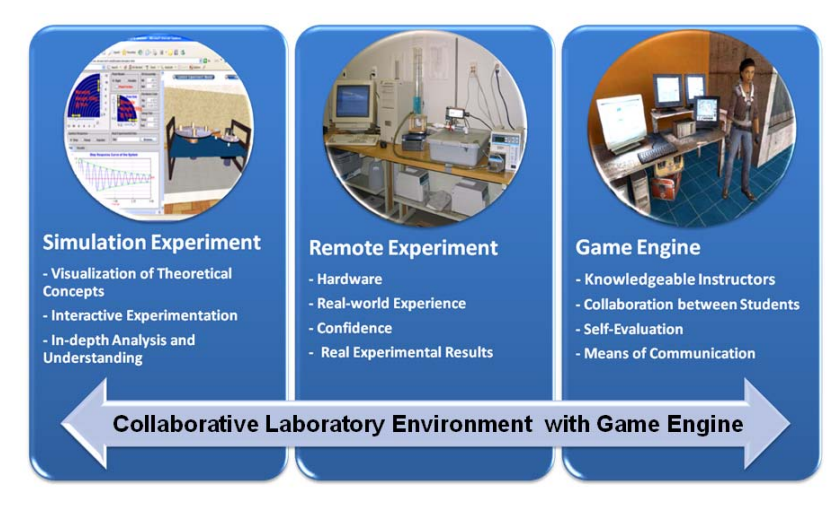
Figure 2: Collaborative laboratory environment [13].