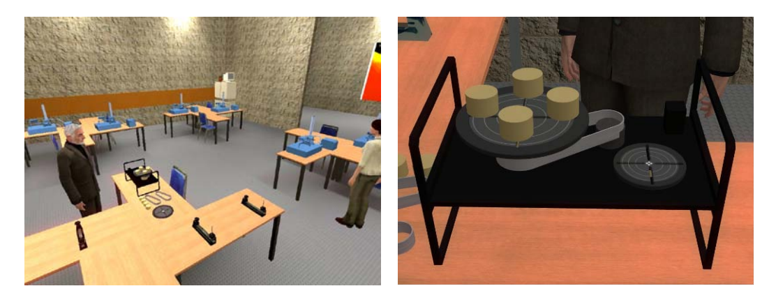
Figure 4: Experiment components of an industrial plant emulator and partially assembled setup.

After introducing the students to the general concept of the game-based learning environment as well as to the specific experimental setup, a knowledge test can then be administered to the students to assess their preparedness for the specific laboratory procedure and possibly guide them to additional instructions, if needed. Subsequently, the students carry out the laboratory assignment, starting with the assembly of the experimental apparatus within the virtual laboratory environment (Figure 4). Subsequently, they either carry out experimental procedures using a remotely accessible actual experimental setup [32] or perform virtual experiments using a software implementation of the experimental setup (Figure 5). Finally, the laboratory session can be concluded by a second knowledge test to evaluate the learning effectiveness of the laboratory session.